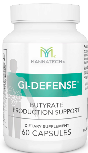
U.S. Product Shown